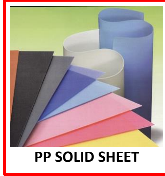
PP SOLID SHEET