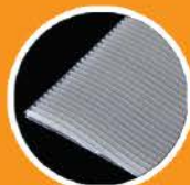
S Guard® PP