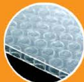
O Guard® PP