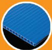
I Guard® PP