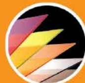
PMMA, PS Sheet