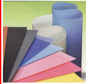
PP SOLID SHEET