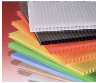
PP CORRUGATED SHEET