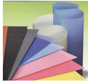
PP SOLID SHEET