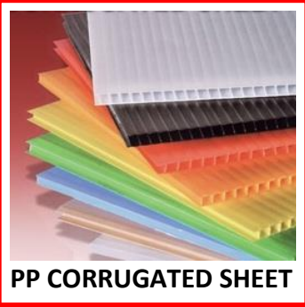
PP CORRUGATED SHEET