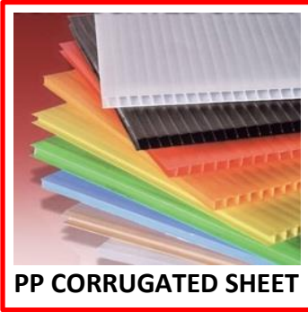
PP CORRUGATED SHEET