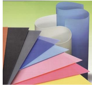
PP SOLID SHEET